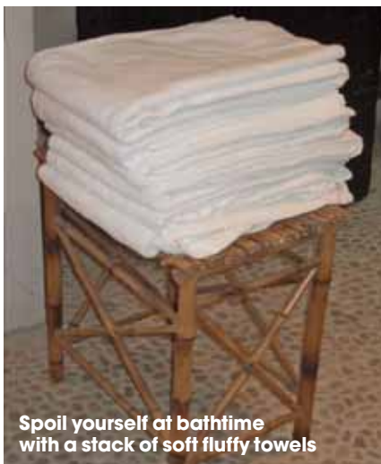
Spoil yourself at bathtime with a stack of soft fluffy towels

Tiled and concrete floors are immensely popular in homes in Ibiza. In the heat of the summer, the cool tiles or concrete are a welcome surface to walk on barefoot. But these same surfaces retain a sharp chill in the winter months and you certainly would not want to be stepping on them with bare feet. If you're having floors laid, consider under-floor heating for added warmth in the winter. It's an excellent, unobtrusive method of heating and can be used throughout the home or just in certain rooms. The control panels often come with timers, perfect for taking the chill off bathroom tiles in the morning before you step in to take a shower. Under-floor heating is also a relatively inexpensive method of heating and easily installed when new flooring is being laid.