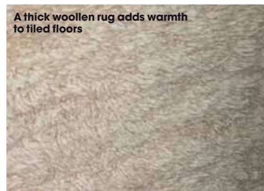
A thick woollen rug adds warmth to tiled floors

Invest in a thick, down-filled winter duvet for maximum warmth and comfort in bed. Add some thick blankets on the end of your bed, perfect for when you're lounging around. Turn your bathroom into your own personal spa, the perfect place to retreat and relax. Although a hot bath would be crazy in the summer, winter is the ideal time to soak in the bath, enhance the mood with wonderful bath oils and