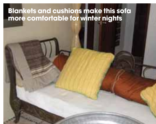
Blankets and cushions make this sofa more comfortable for winter nights

Thick woollen carpets or rugs will help add to that