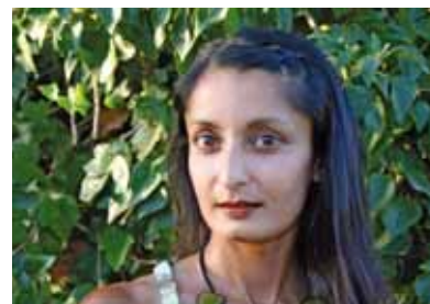
By interior designer Azra Zakir

As the season moves closer towards winter, homes that were perfect summer spots need to be prepared to turn them into cosy retreats for cold days and long evenings. Summers in Ibiza are spent enjoying the outdoors, but the winter months find us all retreating inside. However, there are plenty of ways to make your home a welcoming haven, somewhere to enjoy being inside. The key to really enjoying your home in the winter is to make it as warm, cosy and luxurious as possible. Some things can only be done if you're having major structural reforms taking place, but there are plenty of other ways to turn your home into something to snuggle into.