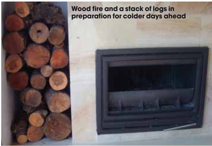
Wood fire and a stack of logs in preparation for colder days ahead