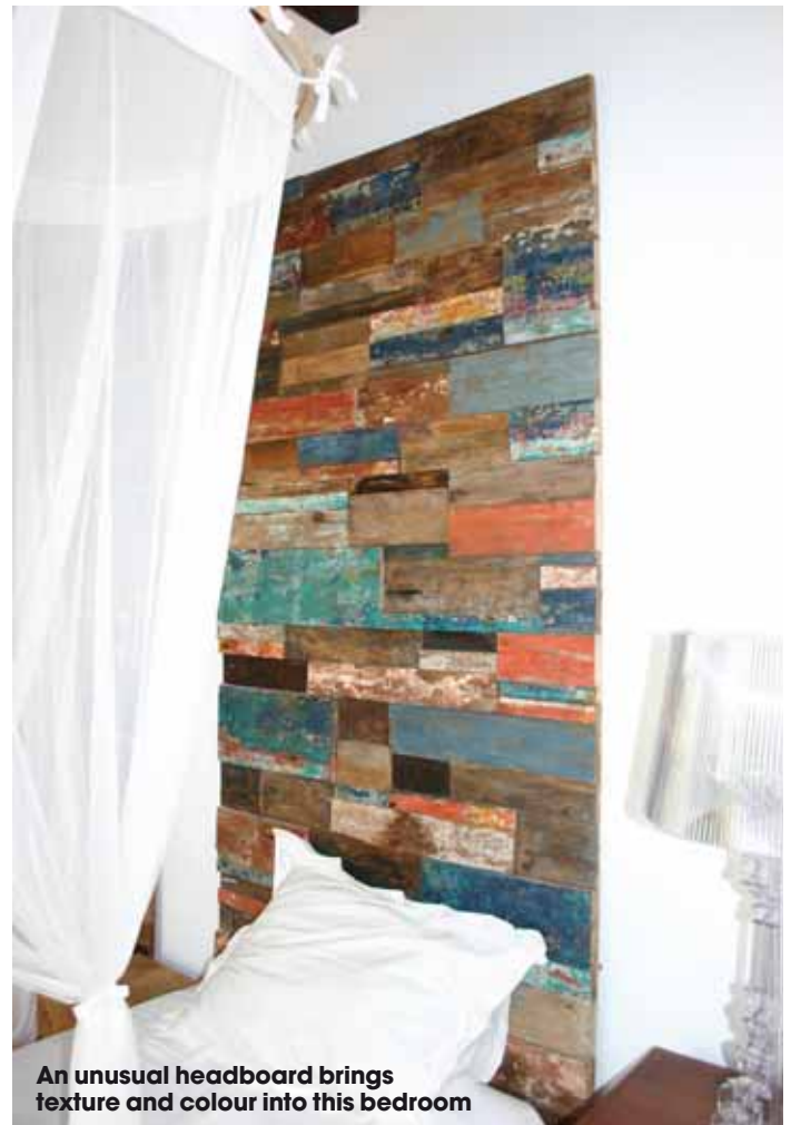
An unusual headboard brings texture and colour into this bedroom

Sleek, shiny surfaces can be balanced with natural stone or wood. Shiny, colourful Vernon Panton chairs, teamed with a solid wood dining table, a wooden bowl on top of a glass and chrome table – natural, organic elements help to add contrast to sleek, modern surfaces. Polished concrete floors contrast well with wood to create a more balanced and harmonious space. Materials that provide an instant feel-good factor – wool, velvet, silk, suede – can help to make your home as luxurious as you want it to be.