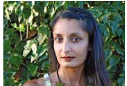
By interior designer Azra Zakir

A long with colour, texture and pattern will help a home to take on a uniquely individual feel. Although the joy of patterns will not appeal to all, a home devoid of textural contrasts will also lack comfort and warmth. The space will be a far cry from a home that is a welcoming haven.